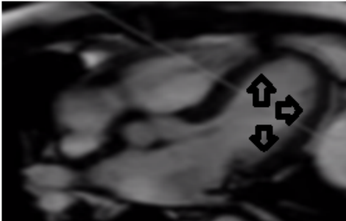
Figure 2. No LGE on cardiac MRI